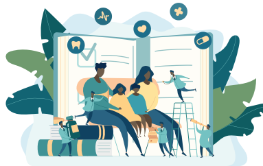
Preventative and routine services