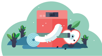
Exercise and obesity counselling