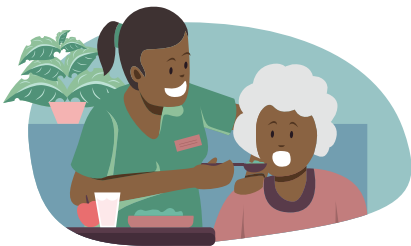
GP and family physician