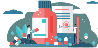
Recognition and onward referral, as well as ongoing support, for alcohol and substance addiction