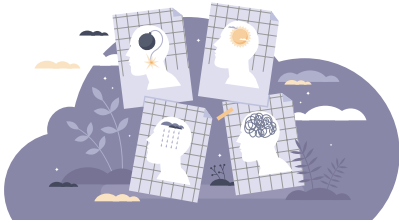
Recognition and ongoing care of mood and anxiety disorders