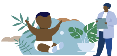
General paediatric and infant care